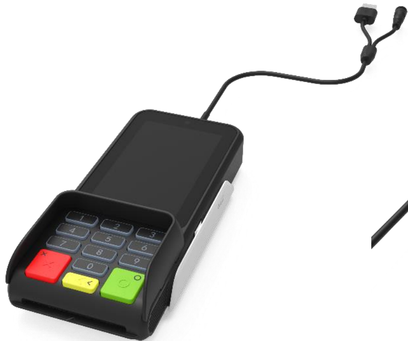
w USB Cable