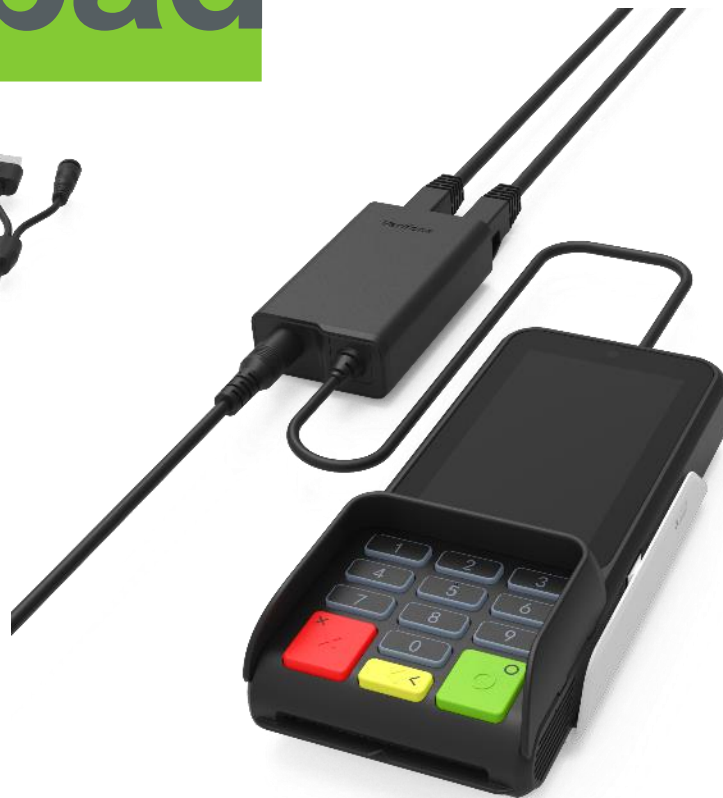
w RS232 Cable or w RS232+ETH Cable